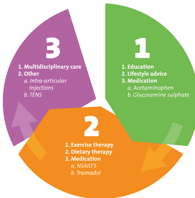
Figure 1. Stepped care strategy named BART, i.e. B eating osteo AR thritis

OA is a prevalent chronic joint disorder, with a substantial impact on individuals and society. 1,3 It can occur in any synovial joint, but patients consult their general practitioner (GP) most frequently for their hip and knee joints. In the Netherlands, the estimated number of patients with knee and hip OA is 312.000 and 238.000 respectively (poll 2007). These numbers are based on Dutch GP-registers, whereas the actual numbers are probably 2-3,5 times higher as most of the patients with OA are not known by their GP. 4 Due to demographic changes and the growing problem of obesity, the prevalence is expected to rise in the next three decades. 5,6