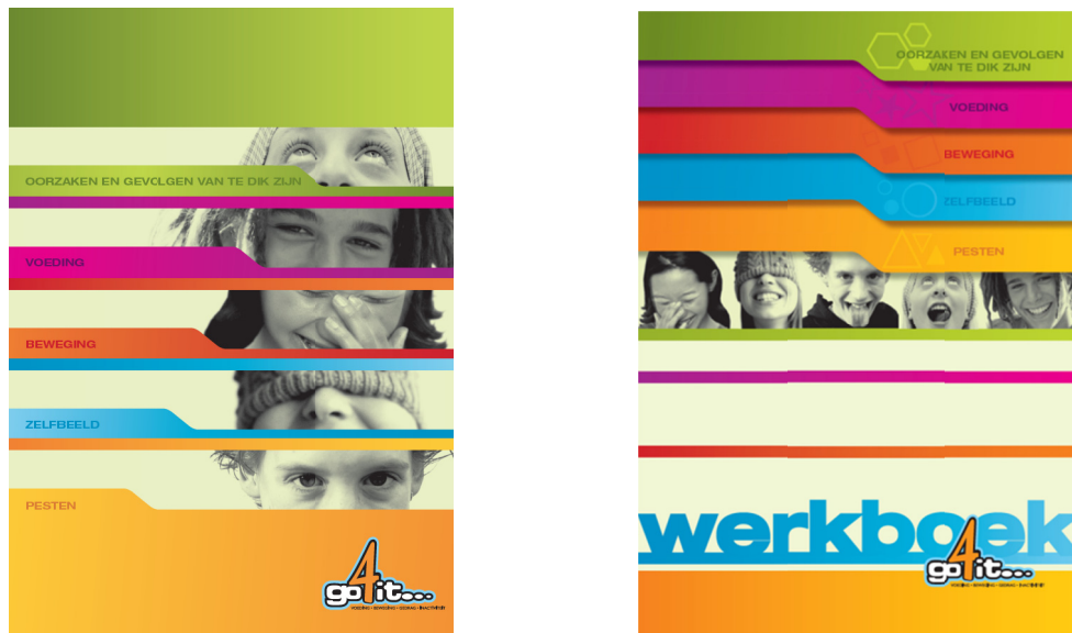
Figure 2: The materials developed for Go4it.