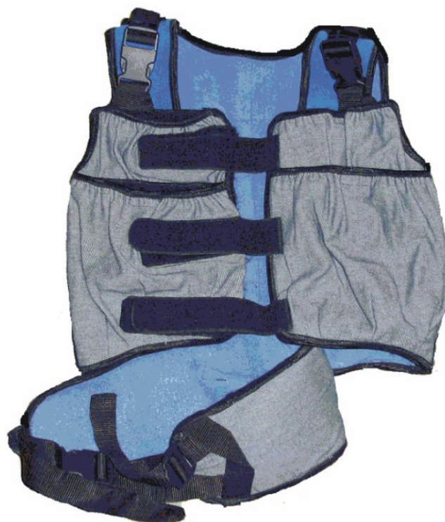
Figure 1 Weight vest.

At the leg-press station resistance was applied by the leg-press machine itself, which was specifically adapted for children by means of an elevated footplate (EN-Dynamic Seated Leg Press, Enraf Nonius, The Netherlands). At the other loaded stations, where functional exercises were performed, resistance was applied by means of a customised weight vest (see Figure 1).